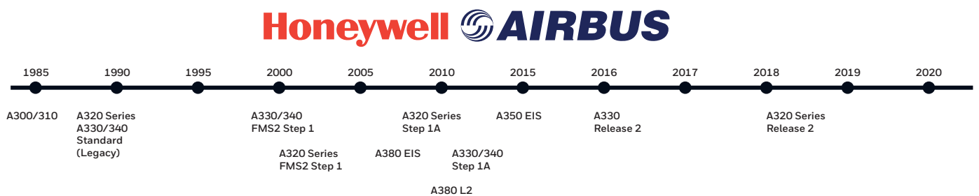
Figure 4: Honeywell Airbus FMS Evolution Timeline

The Honeywell Airbus FMS software has undergone significant evolutions since the first version was certified on the A300/310 in 1986. In the 30 years of joint development of best-in-class FMS on all Airbus airline transport aircraft, many innovations have been incorporated in the baseline that has evolved into the current Pegasus FMS for the A320 series and A330, and the new derivatives that have become the standard (sole source) FMS on the Airbus A380 and A350. The driving force behind the feature and functionality insertions result from both changes within the airspace and innovations that result from Honeywell’s unparalleled breadth of airline transport FMS offerings and industry leadership. Figure 4 below provides a timeline showing the Honeywell Airbus FMS evolutions on the A300/310, A320 Series, A330/340, A380 and A350 covering the entire Airbus fleet, legacy and active model base.