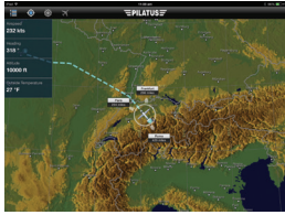
Flight Path App

Honeywell's Global Data Center (GDC) is your partner for comprehensive flight support services. In addition to proven VHF and satellite datalink communications, the GDC also provides a wide variety of essential flight support services designed to help you fly more efficiently and avoid hazardous weather and ATC delays.