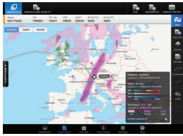
myGDC Flight Planning App

- On ground Flight Plan creation and Loading