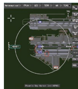
Enhanced Airport Moving Map