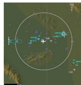
Cockpit Display of Traffic Information Airborne