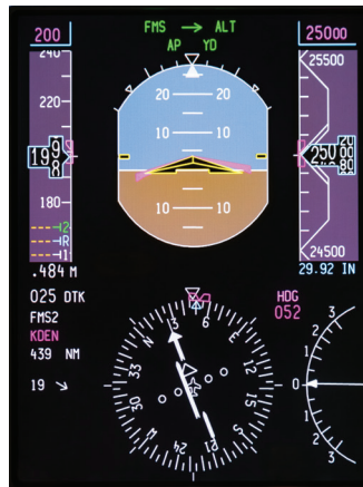
Bright, high-resolution screen