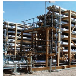
Part of three existing trains installed in the Egyptian desert. Expansion with two additional trains is underway to bring total capacity to 560 MMSCFD.