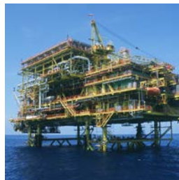
A Separex membrane system rated at 680 MMSCFD was recently installed as part of a large processing platform in the South China Sea.