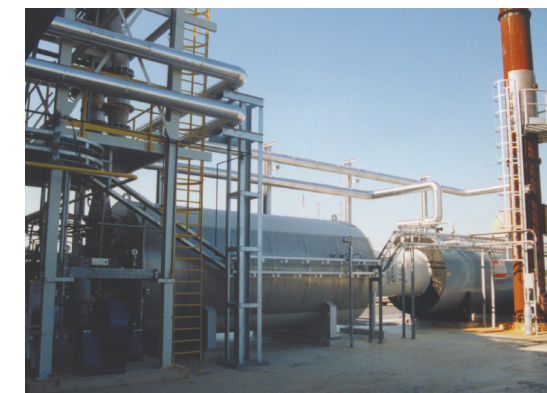
15 MM BTU/hr fume incinerator

Generally, regulations require H 2 S in the flue gas to be 10 ppmv or less; but in certain cases, levels as low as 2 ppmv can be achieved.