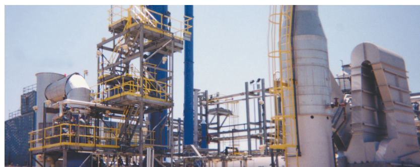
8 MM BTU/hr brominated waste