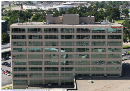
Honeywell UOP Callidus headquarters - Tulsa, Oklahoma, USA