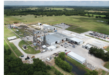
Honeywell UOP Callidus 82,000 sq. ft. manufacturing and fabrication facility in USA