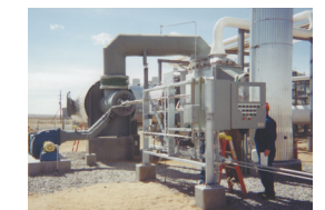
9.5 MM BTU/hr fume incinerator