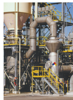
35 MM BTU/hr downfired system