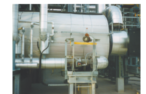
20 MM BTU/hr sulfur plant tail gas incinerator