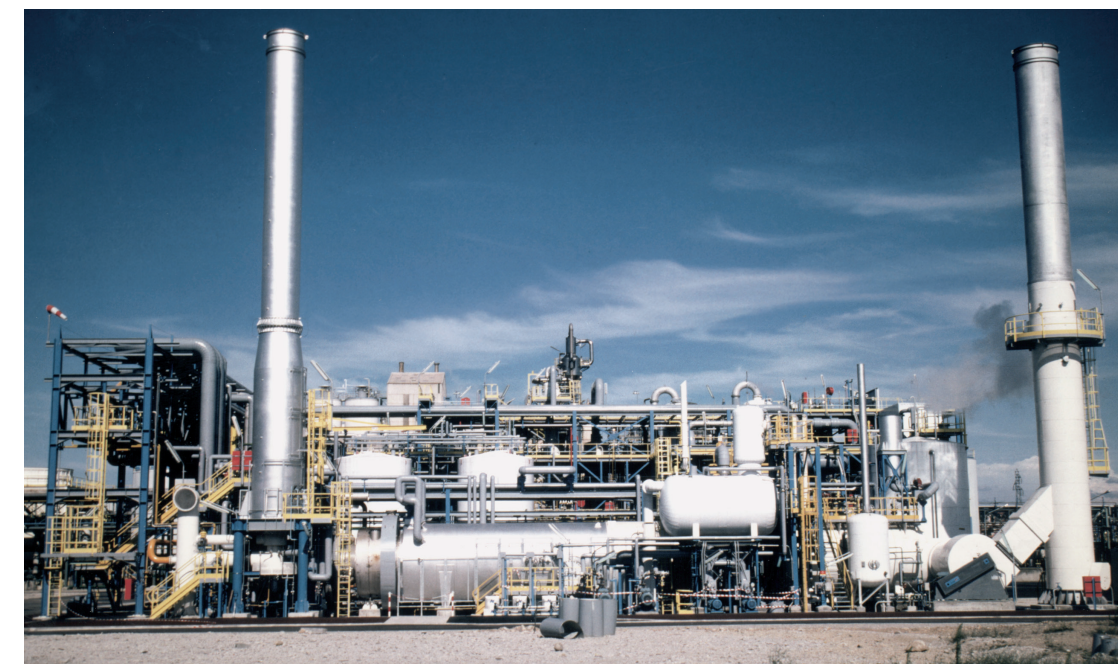
80 MM BTU/hr low NO x system