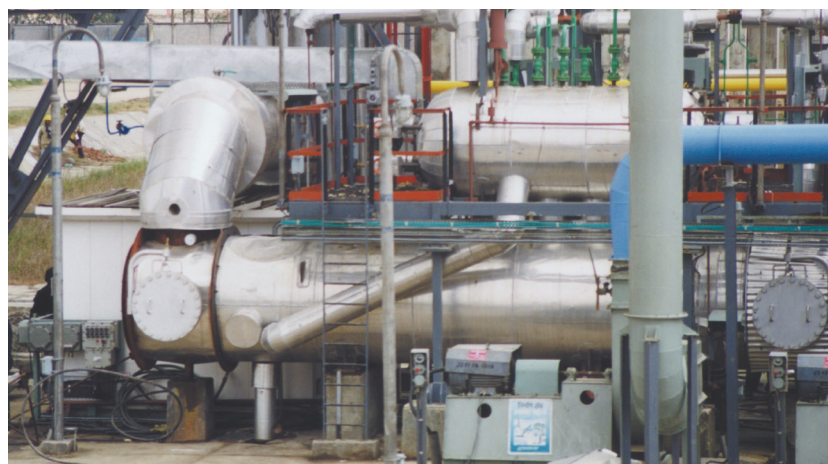
deNOx oxidizer/tail gas unit