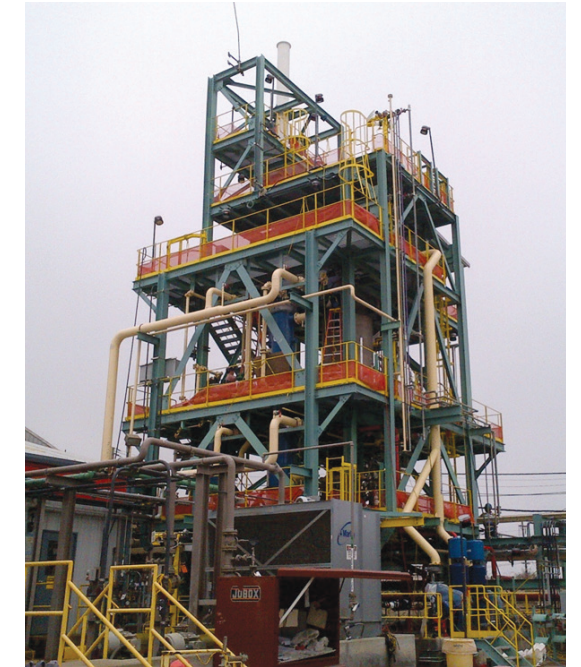
Halogenated Waste Thermal Oxidizer