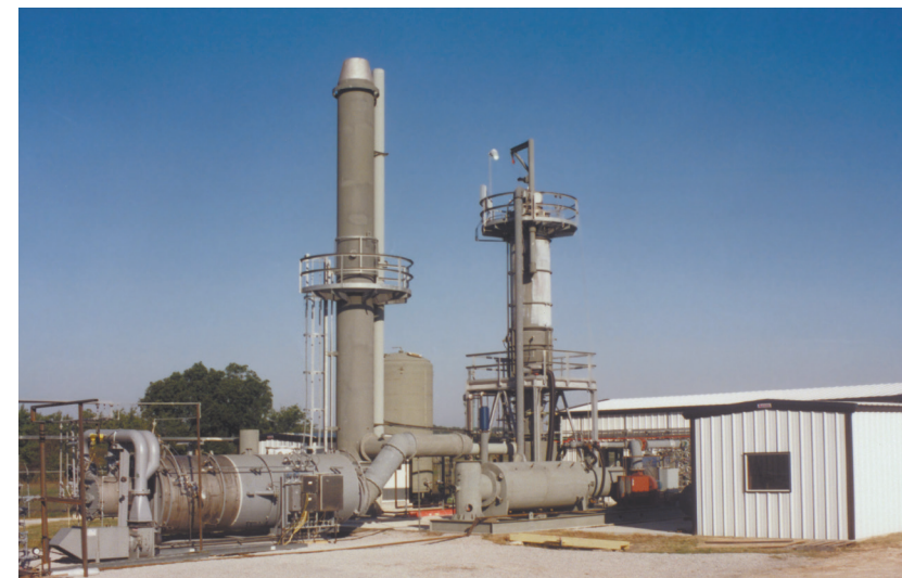
Three stage combustion system at Honeywell UOP Callidus research facility

The combustion process is completed in stage three where the flue gas is oxidized at a temperature of 1700°F to 2000°F with excess oxygen present. NOx in the final flue gas typically ranges from 80 to 200 ppm, depending on the waste composition. A destruction efficiency of 99.99 percent can be achieved for most compounds.