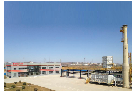
Honeywell UOP Callidus combustion test facility - China