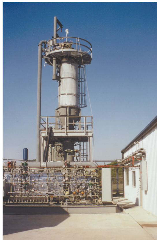
Downfired oxidizer in Honeywell UOP Callidus research facility