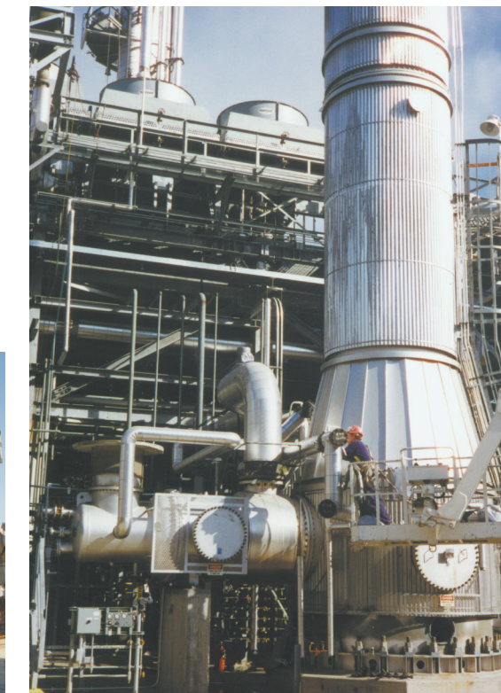
22 MM BTU/hr tail gas unit